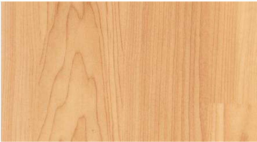
AVE PRO 08 GOLDEN BLONDE

For The Pros: When everything is at the stake allow ACTIVE ® PRO to spring board your performance to victory. A floor with excellent ball bounce consistency, vertical deformation and perfect sliding coefficient. The 7.00 mm thickness makes for excellent sound absorption while protecting your knees and joints from any shocks.