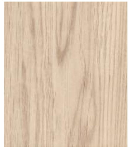
AVE PRO 09 HAZEL WOOD