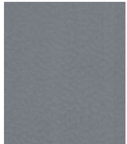
AVE PRO 07 DOLPHIN GREY

Applications: Gymnastics, Basketball, Football, Volleyball, Table Tennis, Wrestling, Badminton, Martial Arts and more.