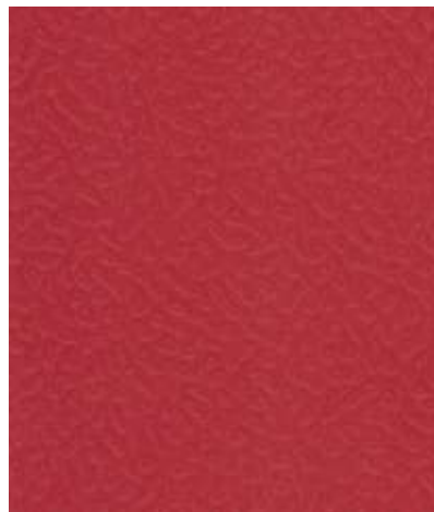
AVE PRO 06 RUBY RED