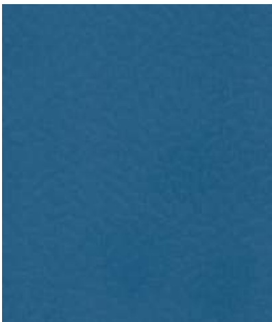
AVE PRO 03 PRESIDENTIAL BLUE